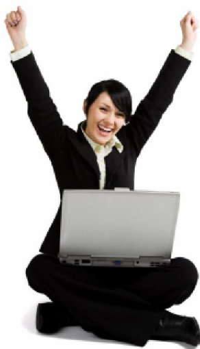
Figure 1: How easy it is.

With the CDI® Premium application, you get a fully integrated financial analysis and reporting tool that provides quick access to comprehensive data. The SMinq Reporting tool uses a familiar interface and unique drag-and drop technology to simplify report creation for financial and operational data.